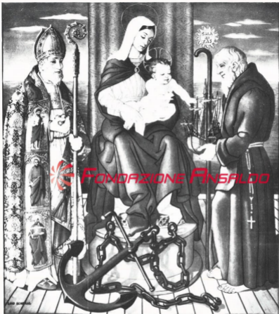
Above the altar in the ship's chapel the "Vergin of the sea", depicted by Lino Schenol.