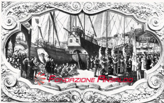
On the foot-piece of the altar the painter has represented the blessing of the three Columbian caravels by the Cardinal Archbishop of Seville, in the presence of Queen Isabel of Spain.