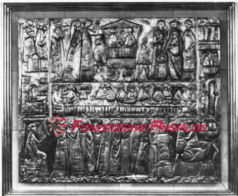
The silver-plated copper bas-reliefs, sculptured by Romano Rui, have as their theme the voyage of Marco Polo.